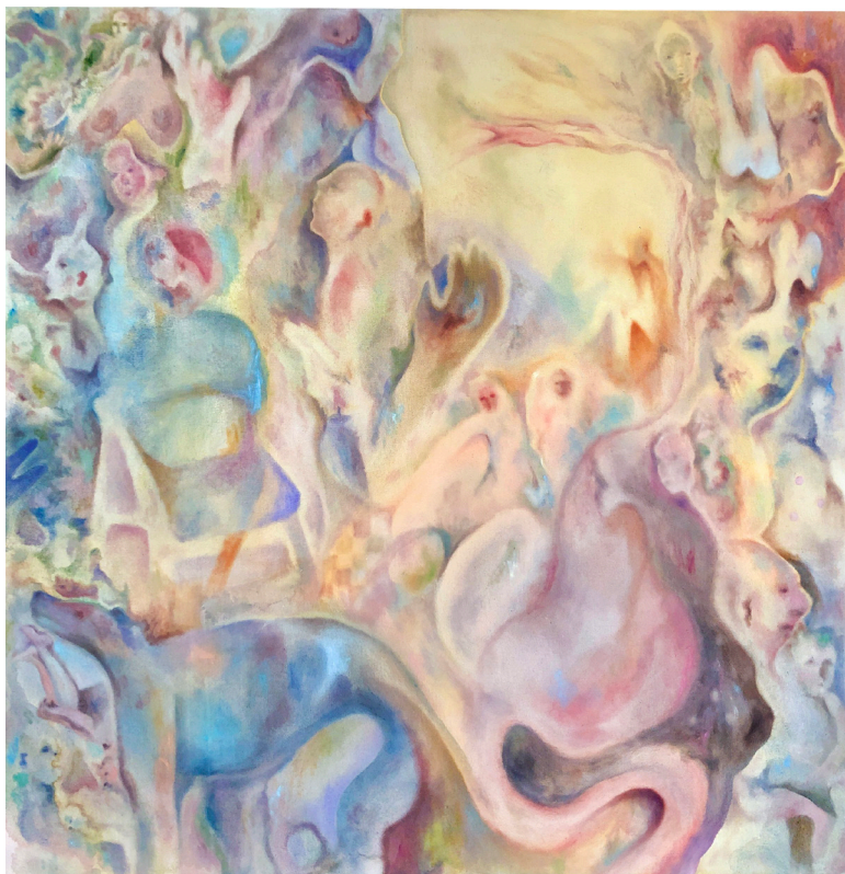
OLIVIA SPRINGBERG, ACID REFLUX