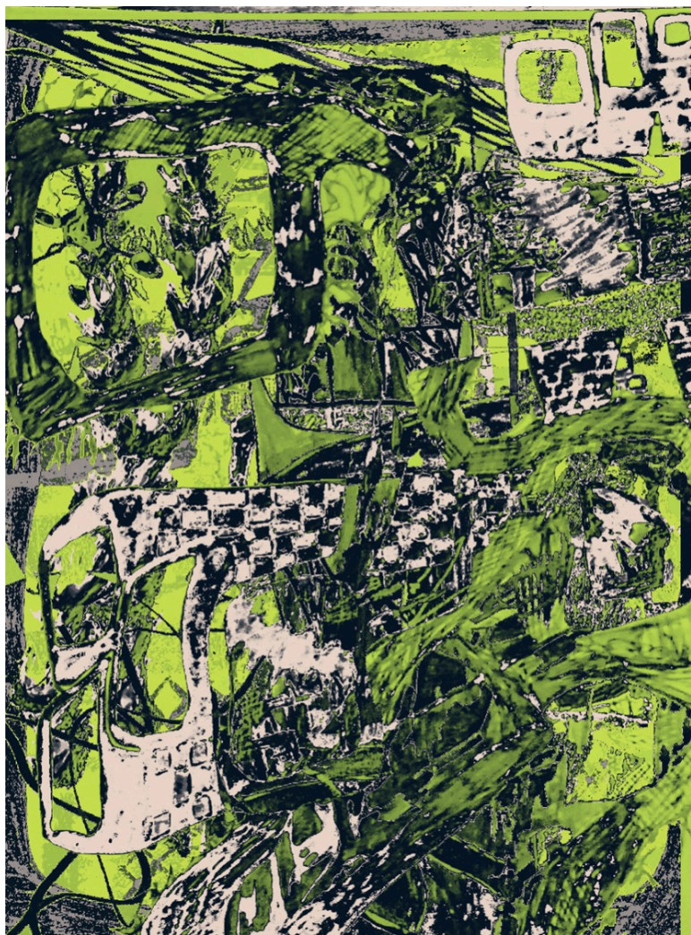
SUMMER D'AMATO, WINDOWS, DOORS AND PORTALS TO THE EMOTION, THROUGH THE FOREST